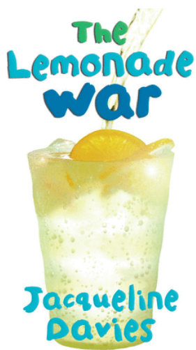
“Entertaining... Good reading for young capitalists.” —USA Today

https://nj02202604.schoolwires.net/Page/3810